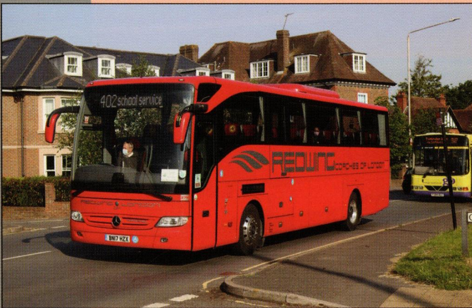
The 402 dates from 1924, then from Bromley to Sevenoaks, later extended to Tonbridge and to Tunbridge Wells. A Century later, Redwing Mercedes coach BN17 HZX approaches TW showing the famous route number that is still in use by Arriva, albeit in this case only a school duplicate. (Richard Godfrey)