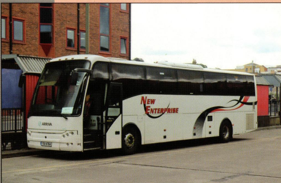
A reminder of the past is this Arriva coach in Guildford Bus Station. It still displays the fleetname New Enterprise, the Arriva subsidiary that was wound up in December 2019. This Berkhof-bodied Scania K114 coach No.2879 is now used as a drivers' rest room.

Rear cover: Brighton Road Purley on 18th October 1994 was host to 600 RGJ, an Epsom Buses Plaxton bodied Bedford YMT. Then their route 498 ran from Croydon via Chipstead Valley to Epsom and its western hospitals. The 498 is now covered mostly by the 166 and Epsom Buses (latterly part of RATP) is no more.