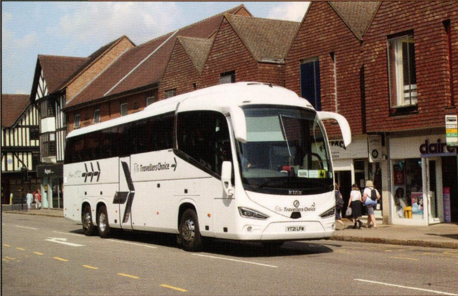
Various duplicate school buses continued to the end of the July term. This brand-new Travellers Choice Irizar i6 coach YT21 LFW is travelling through Hitchin on the S101 duplicating part of Arriva's 101.